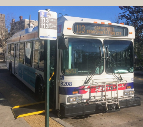
SEPTA bus with wheelchair ramp deployed

Many buses offer connecting service to other public transit lines in Delaware County. Rail stations where bus-to-rail transfers are available are shown in the tables and line diagrams of this guide. Bus-to-bus transfers are also available at many locations. For more information on transfers, visit www.septa.org/fares/transit/index.html .